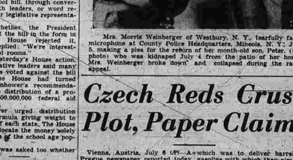
Czech Reds Crush Plot, Paper Claims