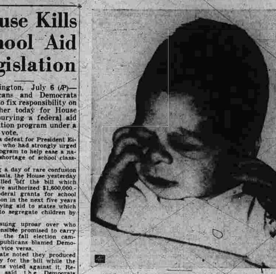
Pleads for Return of Her Baby

Poznan Reds Fear New Worker Riots. Berlin, July 6 (AP)—A West German businessman said today that Communist rioting in Poland's second largest city of Poznan had started.